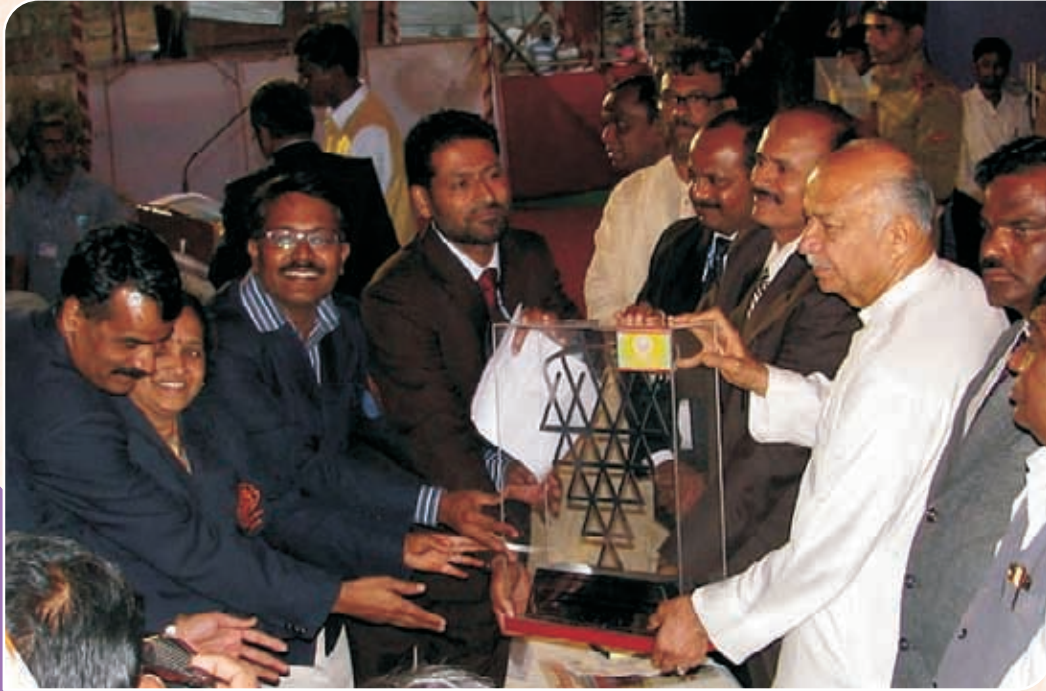
Hon'ble Mr. Sushil Kumar Shinde, Union Minister of Power giving a Winner trophy of AVISHKAR-2009 to Team Managers of University of Pune