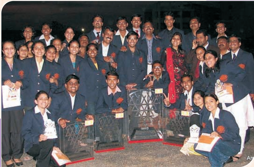
Team members and team managers with winning trophies of AVISHKAR-2009